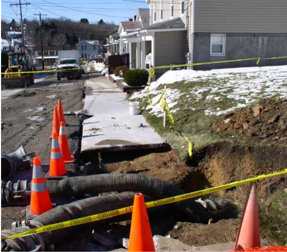
Figure 1 Blowout Location