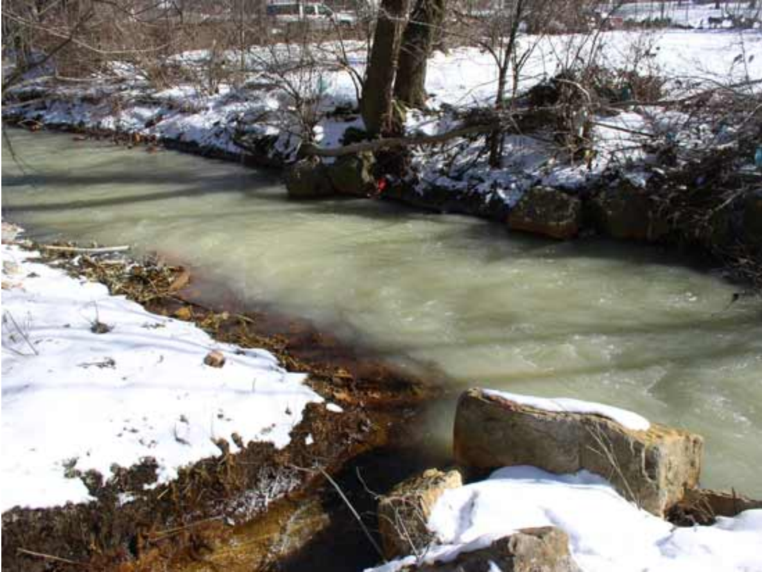
Figure 3 Current Discharge