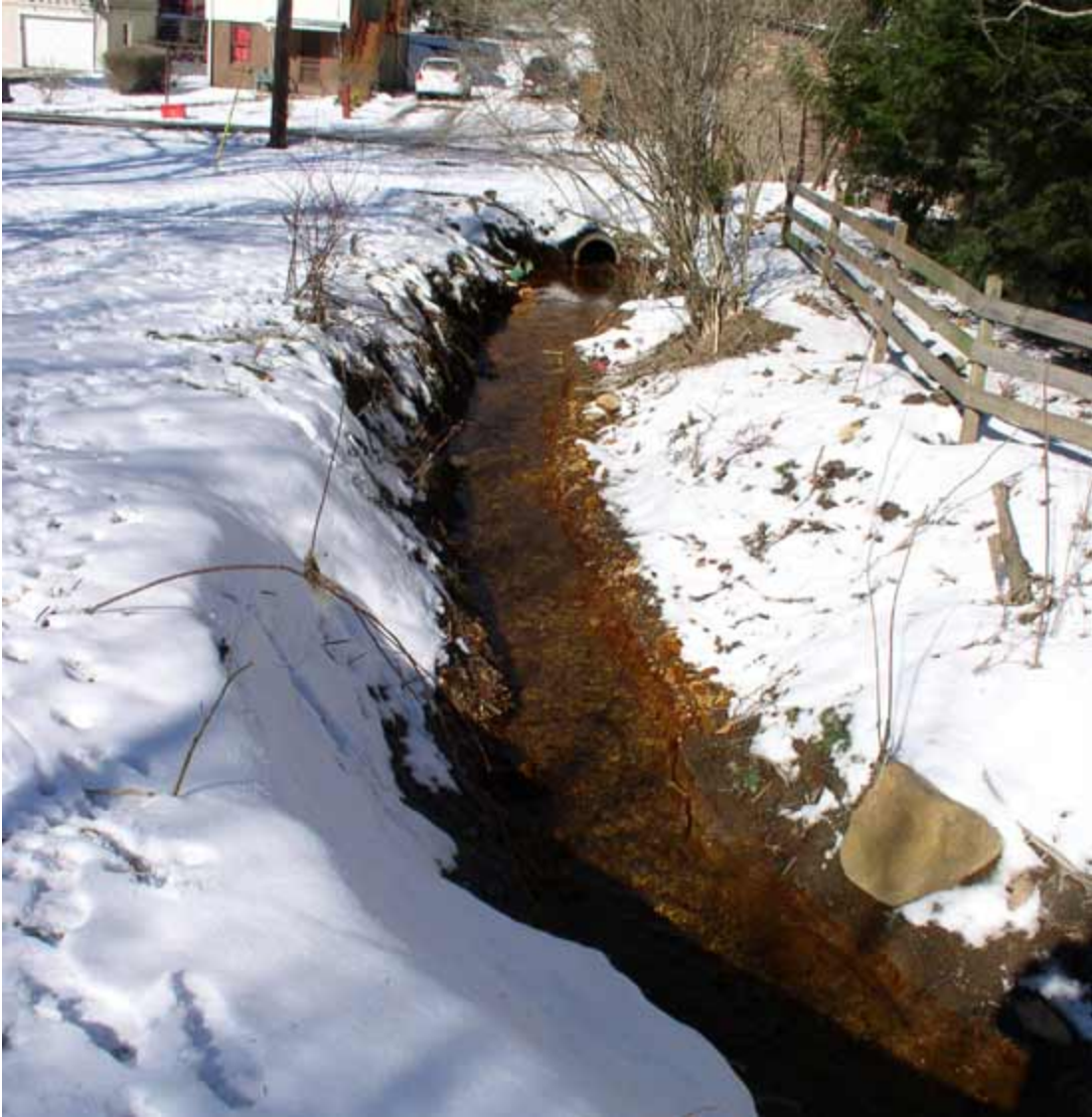
Figure 5 Up-gradient Spring