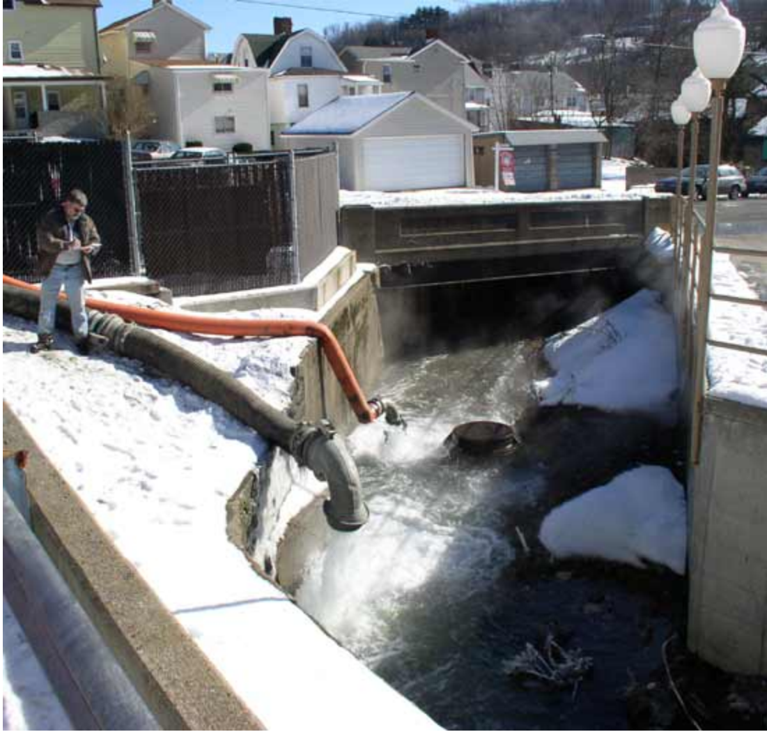
Figure 2 Pumped Discharge Location