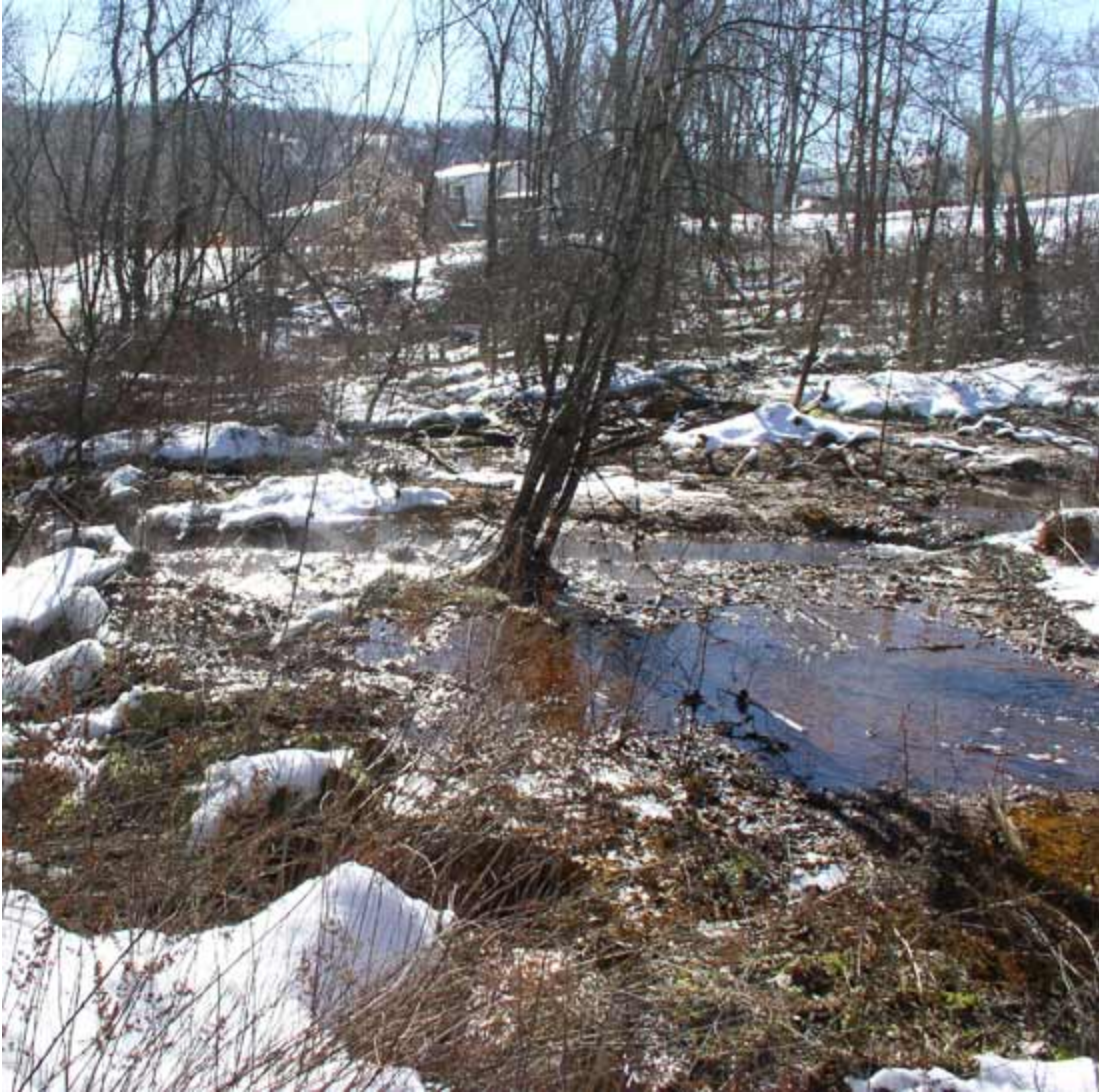
Figure 4 Up-gradient Seepage